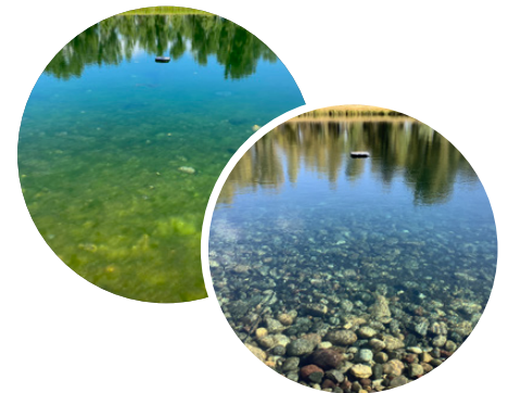
Wilson Pond -- Spirogyra