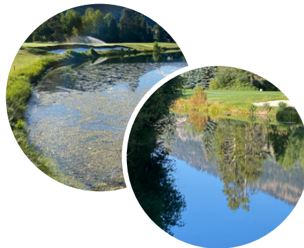
Teton Pines -- Blue-Green Algae